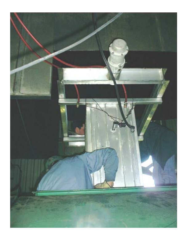
Figure 2. Exhaust Stack Extension and Sampling Systems

On the top of the stack, an opacity smoke meter adaptor was mounted, the smoke meter aligned with the long axis of the rectangular exhaust stack (Figure 2). The center of the light beam to the outlet of the stack extension is 5\pm1 inch. Smoke opacity signals were transferred to a control unit, which was located in the engine test control room, through a 45-feet cable. A computer program was used to record smoke opacity data at rate of 100 samples per second with a response time of 0.25 seconds. The linearity of the smoke meter is 1% from 0-100% opacity