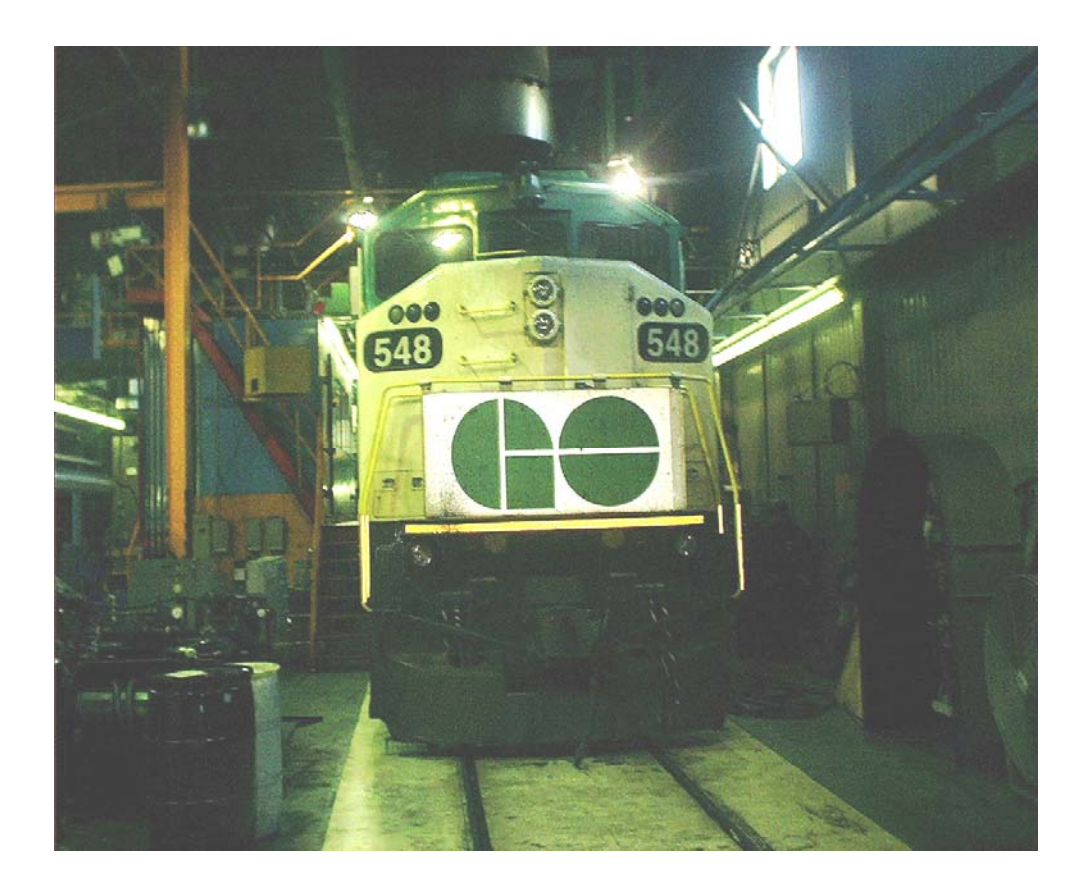
Figure 1. EMD Model F59PH Passenger Locomotive for the Test